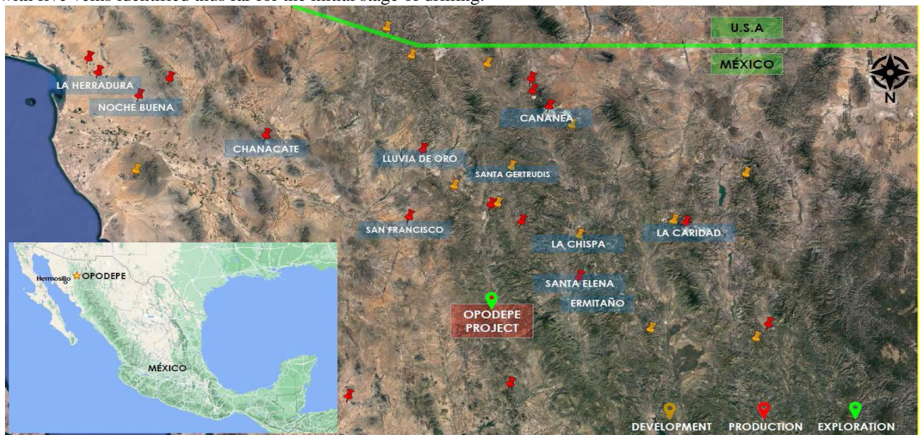
Fig. 1 OPODEPE PROJECT LOCATION

The Company announced the start of DDH exploration on its MEZTLI 4 and TEOCUITLA claims located in Opodepe, Sonora, Mexico (see Fig.1). This first stage explores five different veins that were discovered after more than eight months of geological works with more than 2000 samples taken (see Fig. 2). As reported in its news release of August 17, 2021, the Opodepe project represents a three-dimensional prospect for Starcore with possibilities as a moly deposit, or as a property with gold showings, and thirdly as a project with the potential for copper porphyry at depth. These concessions of 11,364 hectares (the MEZTLI 4 claims) have never been explored for precious metals. With the acquisition of 3,087 hectares northwest of the MEZTLI 4 claims (the TEOCUITLA concessions), Starcore now has a total of 14,451 hectares to explore, with five veins identified thus far for the initial stage of drilling.